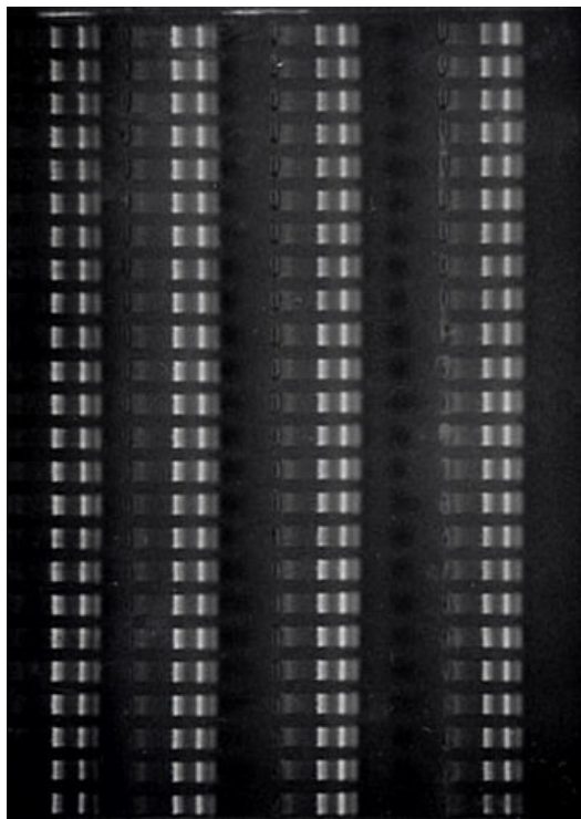
Figure 1: Example of a Cycler Control test (96-well tray)

In case of unequal or even absent amplification results in any slot, it is recommended to repeat the test. If the deficiency is reproducible, the thermal cycler needs to be serviced by the manufacturer.